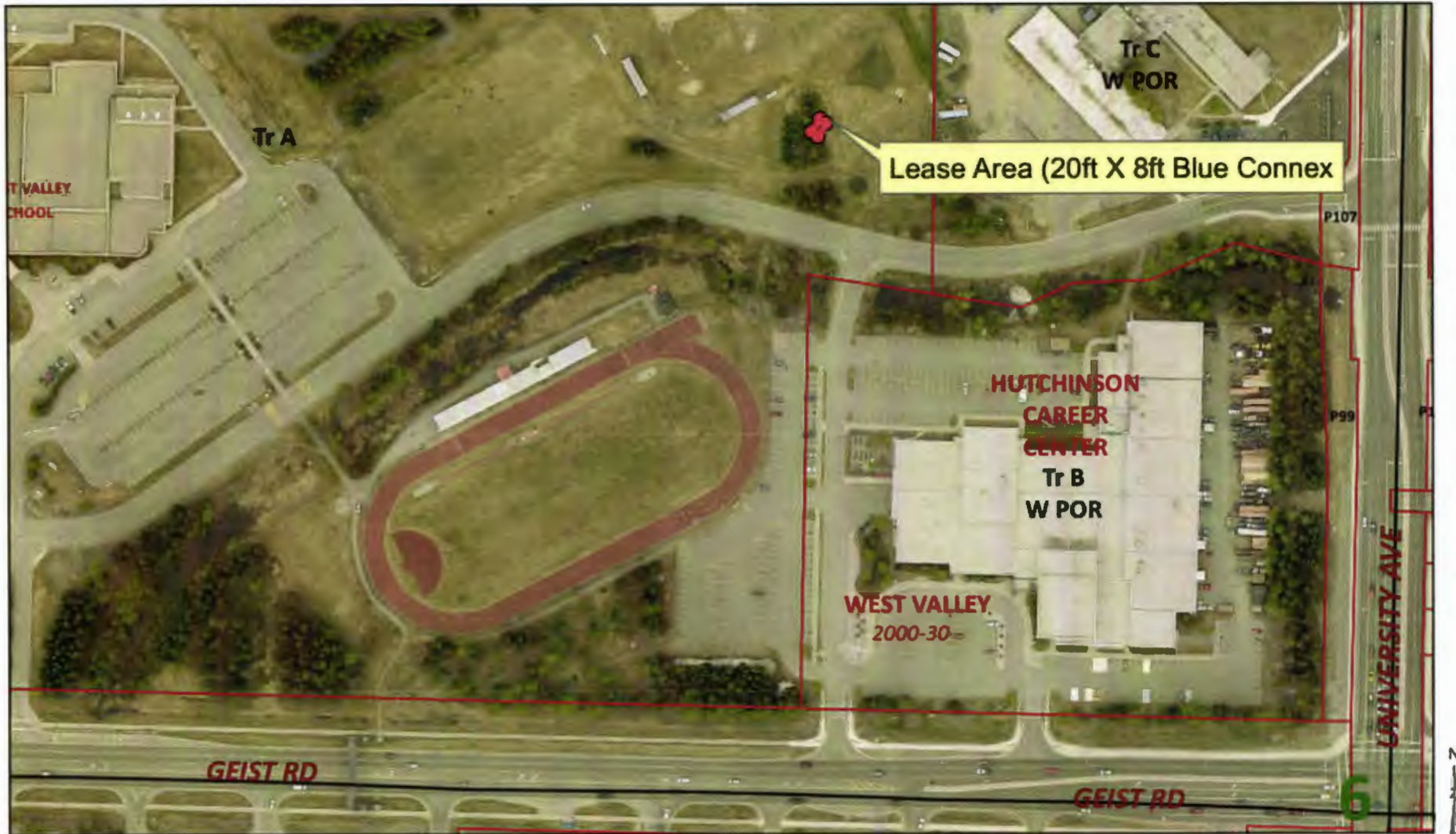
Exhibit Map "A"